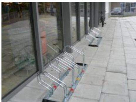
New 'wheelbender' bike racks at Lidl, Clapham Junction

We're disappointed to report that, following recent refurbishment, the former high quality sheffield stands at Lidl's Clapham Junction store have been replaced by inferior wheelbenders, shown in the picture. Though well located for the shop's entrance, as before, the design is extremely poor in that they don't support a bicycle nor allow users to secure their cycles adequately. Needless to say, many cyclists are reluctant to use them. No response from Lidl, which is a private company, has been forthcoming to enquiries and complaints about these racks.