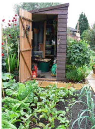
Best kept plot in Wandsworth (and possibly the world)

Owing to my slightly late start, I missed seeing the Balham allotment site which has the distinction of having the highest ratio in London of ploholders, or 'plotters', to people on the waiting list. (Admittedly it only has six plots). The variety of sites was a surprise to us, each with its own very distinctive style.