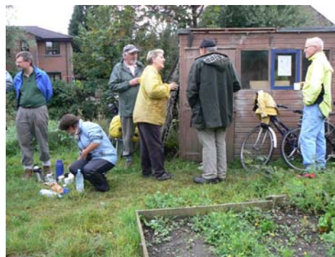
Welcome tea and biscuits on arrival at Sailor Prince