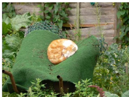
Cat in supervisory role at Doverhouse allotments