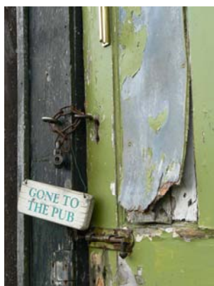
Beer and allotments seems to go together

Having decided to leave Wandsworth's Morden outpost allotment to another occasion, the remainder of us paid a visit to the renovated 'Telegraph' on Putney Heath for some welcome refreshment.